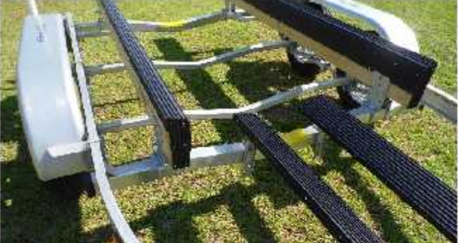
1.1 Before and after installation Photo, (Complete photo courtesy of www.boatrailer.com)