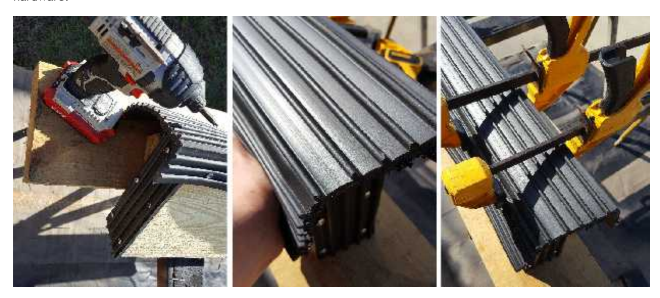
FiG 3.0 Left, Note the screw placement for the end of the bunk board. Right(2), Attaching the cover to the front of beam, Screws should be placed on last row or two of ridges along front side, far and away from any possible contact point with hull.

First align the Angled Leg on the outside of the Bunk Beam. Hold the cover firmly against the leading corner and attach the length of the outside leg to the Bunk beam. Place screws 6-8" apart while beginning with double screws. Once the outside leg (leading edge) is installed pull the remaining cover tight against the face of the top of the bunk beam. Place clamps along the face side to hold the bunk cover in place while inserting mounting hardware.