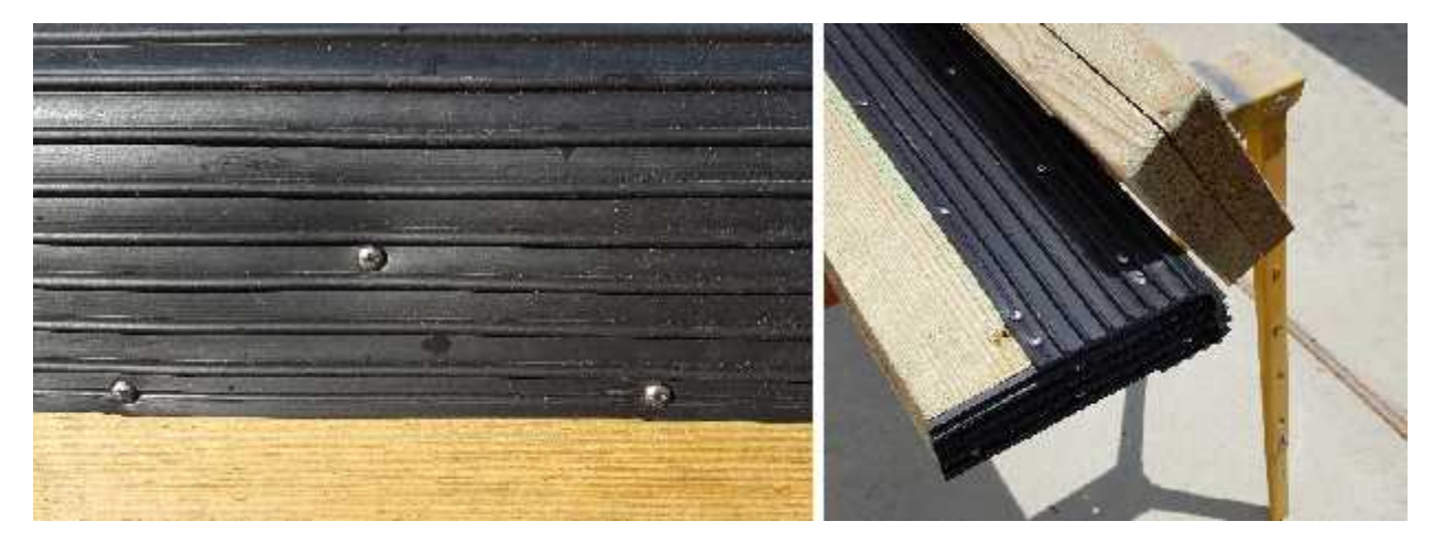
FIG 3.2 Additional screws installed to secure excess cover width. If desired cover can be trimmed to any final width. Ensure all screws are mounted within the channels and away from any facing that contacts the hull. Stainless Steel Staples can be used as well (not shown) as the primary mounting is done with the recommended screws.

If the Inside face of your GB7 Cover is longer on your Beam application you may also consider adding additional hardware to ensure a snug fit. While stailess steel screw with button heads are recommended you may use staples in areas that you wish to have extra fasteners for cosmetic use. IN the below picture screws are mounted alternating with the primary mounting hardware.