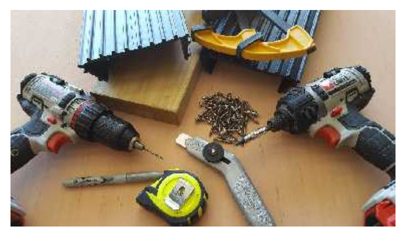
Fig 1.2 Common Installation tools