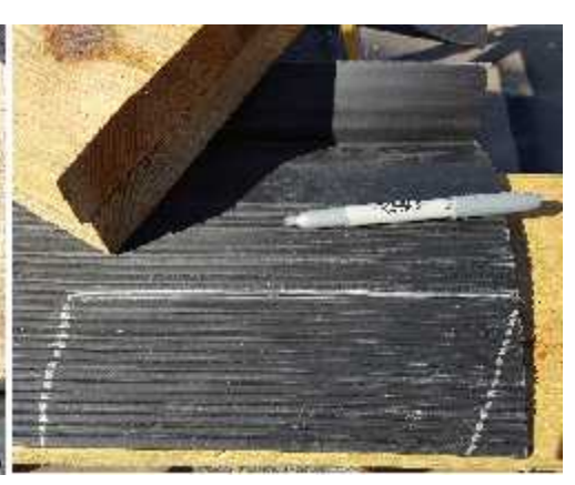
FIG 2 Plan how the end of your bunk covers will appear when completed