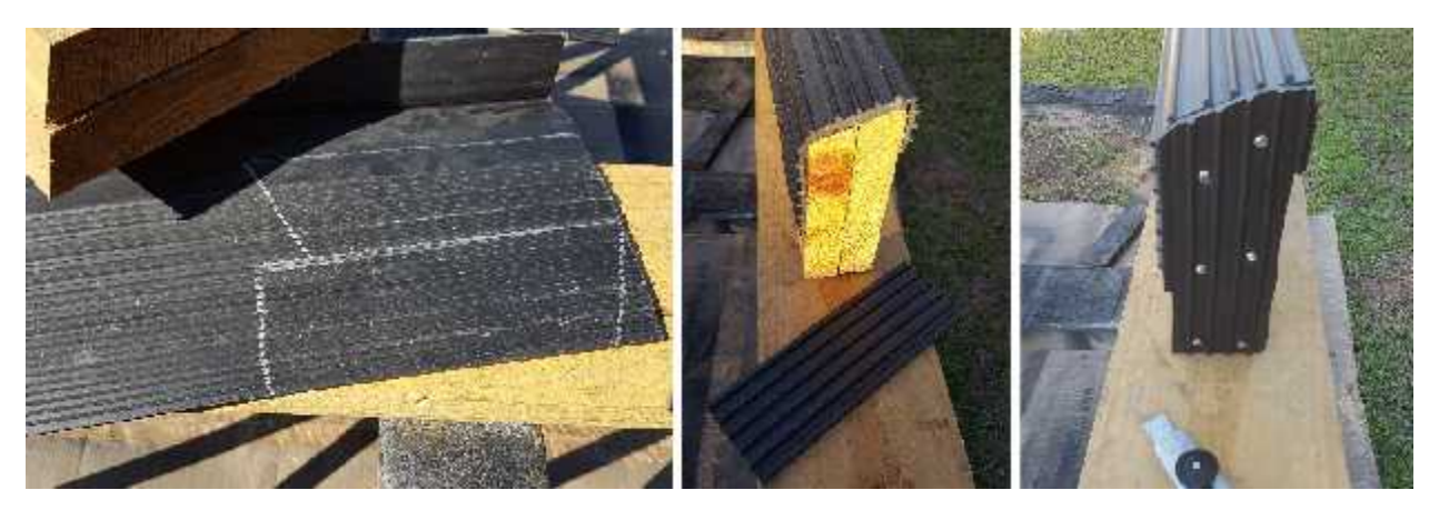
FIG 4 Use the end of the bunk Beam to create the pattern that you need for your end cap, once mounted trim the End of the cover or cap to complete the fit.

If using the flat end cap installation method your bunk covers should cover the bunk board from end to end and be flush with the end of the beam. Trim any excess using a fixed blade or utility knife. Flat style end caps can be attached directly to the end of the board and should cover edge to edge with the cover.