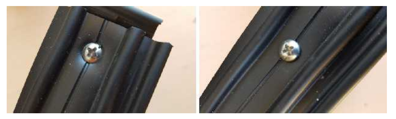
FIG 3.1 The screw on the left has been installed too tightly. The screw on the right has been installed correctly and just begins to bind the Bunk material

If the Inside face of your GB7 Cover is longer on your Beam application you may also consider adding additional hardware to ensure a snug fit. While stailess steel screw with button heads are recommended you may use staples in areas that you wish to have extra fasteners for cosmetic use. IN the below picture screws are mounted alternating with the primary mounting hardware.